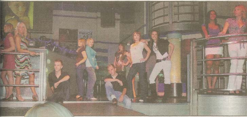
The contestants on stage at Club Ice (20701-53)